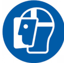
Face shield (in identified areas only)